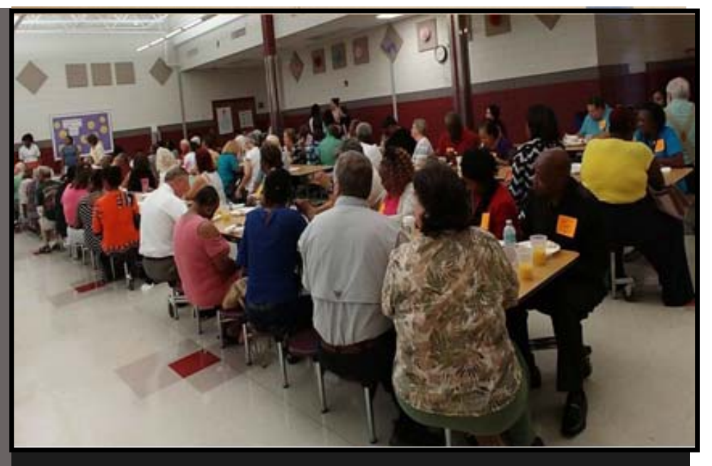
Parents receiving valuable information at a school's parent night

Additionally, the Federal Programs department will provide training to principals so principals will understand parent and family engagement requirements and plan opportunities for family engagement activities and meetings for the remainder of the school year.